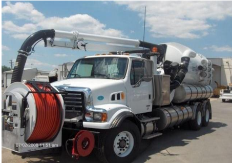
CGW must clean grease from sewer lines to prevent overflows.