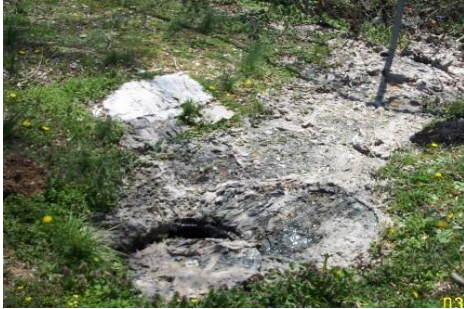
Sanitary Sewer Overflows caused by fats, oils and grease.

Your residential area was recently identified as causing obstruction to the sanitary sewer system due to Fats, Oils and Grease (FOG) discharged from houses in your neighborhood. FOG obstruction and interference to the sanitary sewer system can cause sanitary sewer overflows which pollute Clarksville's streams. The United States Environmental Protection Agency (EPA) and the Tennessee Department of Environment & Conservation require the Clarksville Wastewater Department to take action to prevent sanitary sewer overflows. This notification is to make you aware of fats, oils and grease pollution prevention actions you should take to prevent sewer line blockages and sanitary sewer overflows.