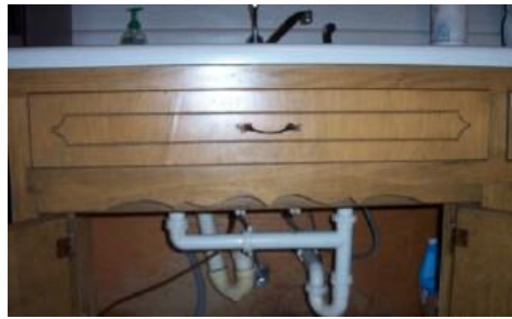
Fats, oils & grease can cause blockage in your home's sewer system too.