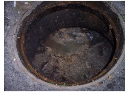
Sewer line blockage from grease.